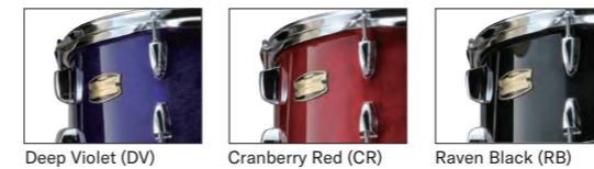
Deep Violet (DV) Cranberry Red (CR) Raven Black (RB)