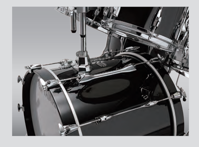
Classic Walnut (WLN)

The revamped modern design retains the traditional essence of the Recording Custom. In order to maximum the attenuating properties of the birch wood, we've increased the weight of the lug, further enhancing the artist's expressive power and reducing undesirable noise from the shell without using a mute. This ensures optimum sustain for the core sound, producing a crisp, articulate tone.