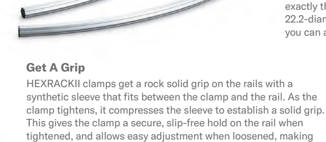
HXAC II HXCP3