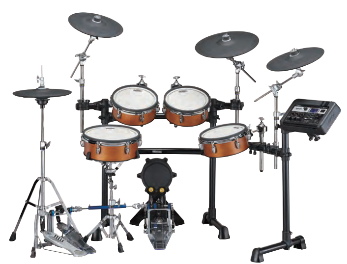
DTX8K-X Real Wood