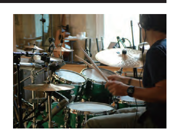
Pads & Rack *For more info please visit P52.

The Kit Modifier featured on the DTX-PRO offers drummers limitless possibilities for their creativity. The KIT MODIFIER knobs condense the sound creation knowhow that Yamaha has accumulated over decades into three knobs: AMBIENCE, COMPRESSION, and EFFECT.