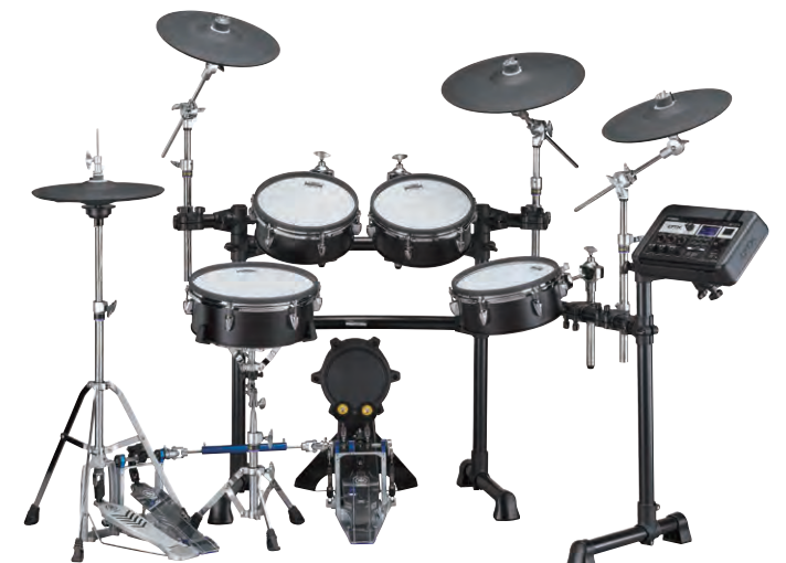
DTX8K-M Black Forest